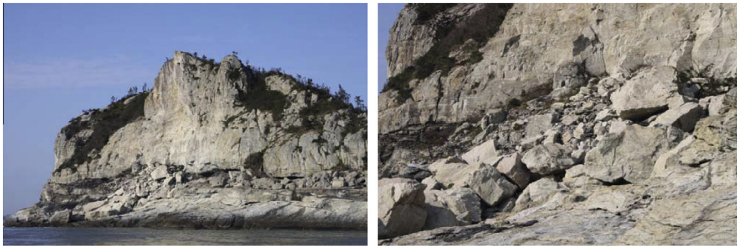
Fig. 9 Sea cliff (left) and talus (right).

or travel management. Of these patterns, the guided tour is the most effective (Woo, 2014).