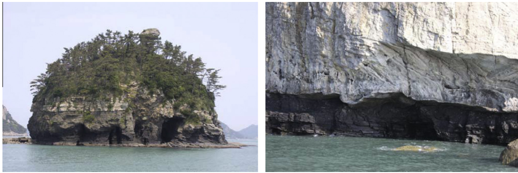
Fig. 6 Sea cave (left) and sea notch (right).