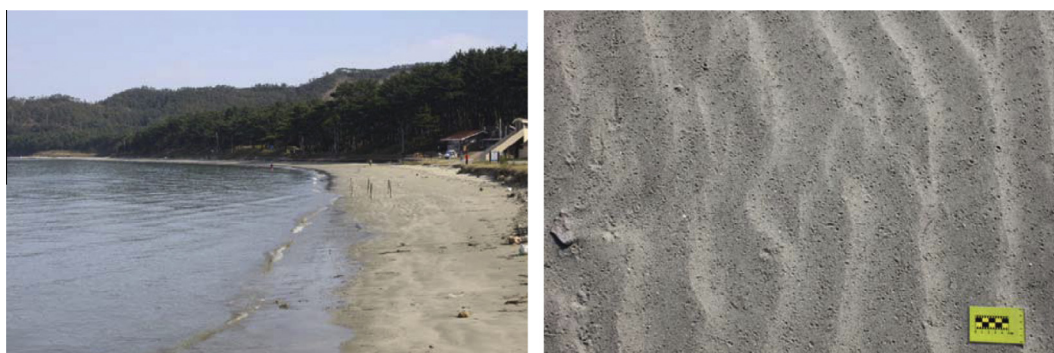
Fig. 3 Beach of Gwanmae Island (left) and ripple mark (right).