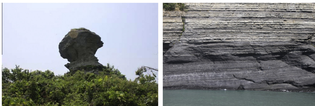
Fig. 4 Tor (left) and sedimentary formation (right).

In the western area of Gwanmae Island, sea cliffs develop nearly vertically. Strong wave action should produce the cliffs, and talus debris are scattered on their bases. Together with