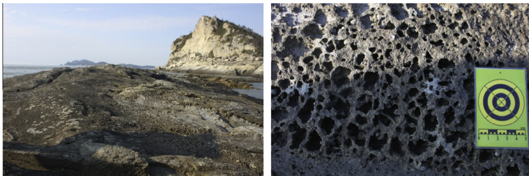
Fig. 8 Coastal platform (left) and tafoni (right).

cliffs, wave action forms a coastal terrace, combining of sea level change. Sea notches and tafoni develop around the sea cliffs as well due to differential erosion (Fig. 9).