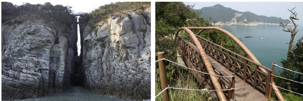
Fig. 7 Joint (left) and bridge (right).