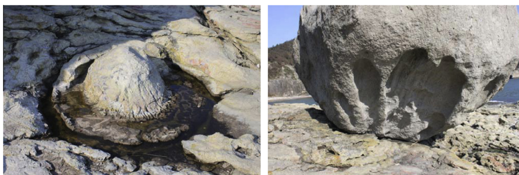
Fig. 5 Stone tomb (left) and Ggongdol (right).